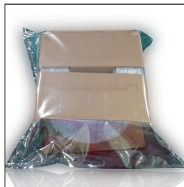
( 2 )