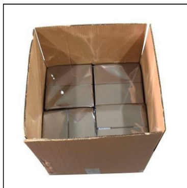
( 3 )