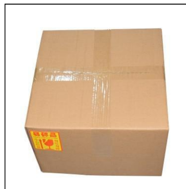
( 4 )