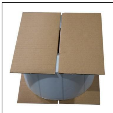
( 1 )