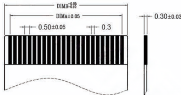
SUITABLE FLAT LINE