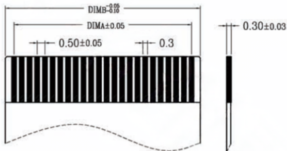
SUITABLE FLAT LINE