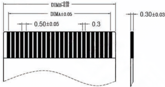
SUITABLE FLAT LINE